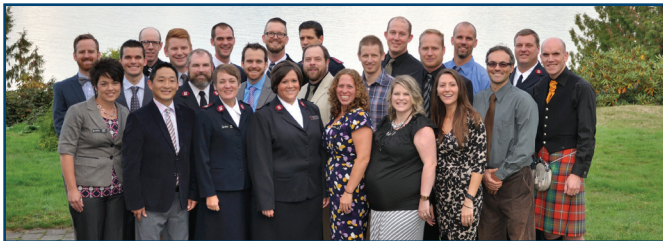
Arrow's 36th Class

We will also continue to explore new ways to engage more leaders in the USA.